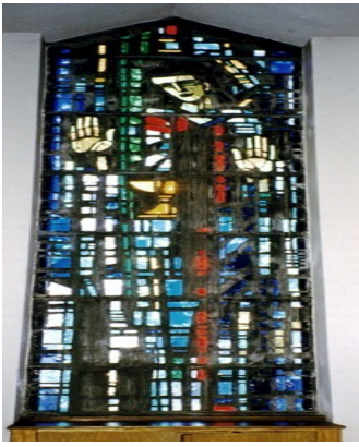
St John the Evangelist Stevenston