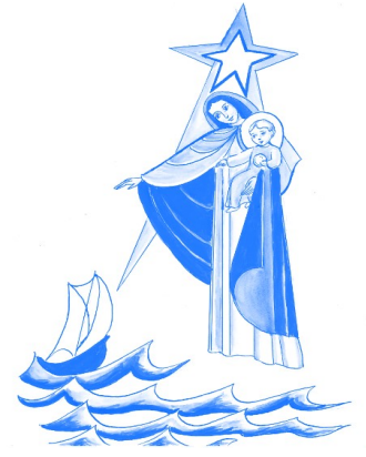
Our Lady Star of the Sea Saltcoats