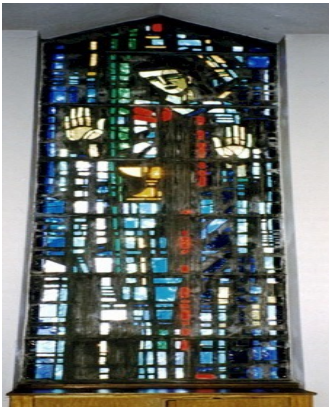
St John the Evangelist Stevenston