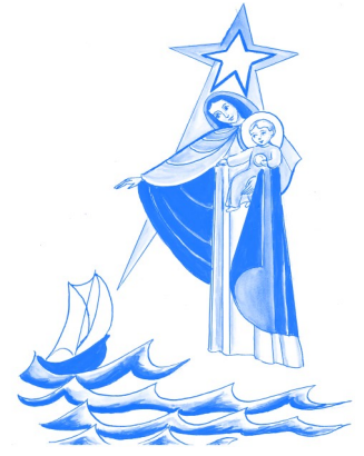
Our Lady Star of the Sea Saltcoats