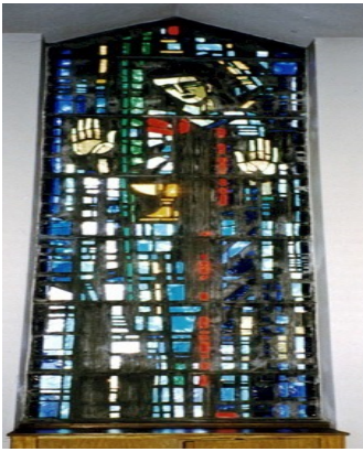
St John the Evangelist Stevenston