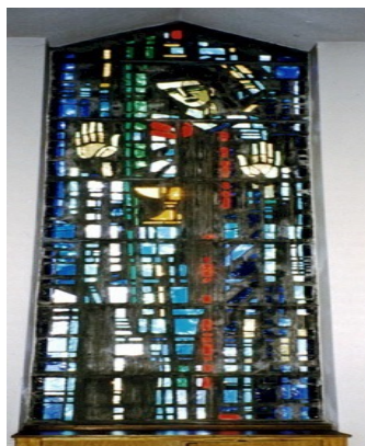
St John the Evangelist Stevenston