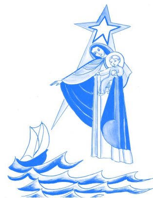
Our Lady Star of the Sea Saltcoats