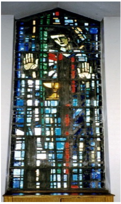
St John the Evangelist Stevenston