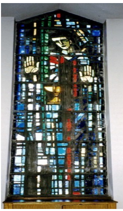
St John the Evangelist Stevenston