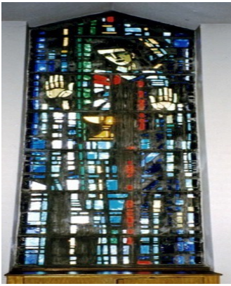
St John the Evangelist Stevenston