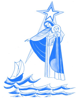
Our Lady Star of the Sea Saltcoats