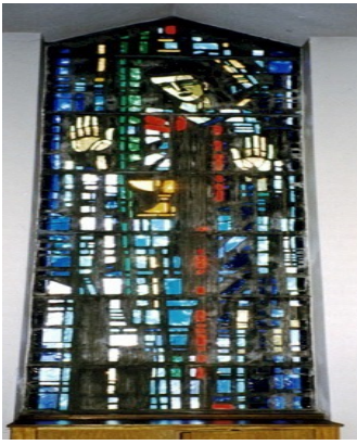
St John the Evangelist Stevenson