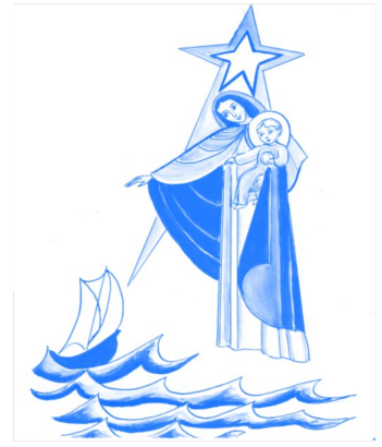
Our Lady Star of the Sea Saltcoats