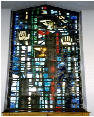
St John the Evangelist Stevenson