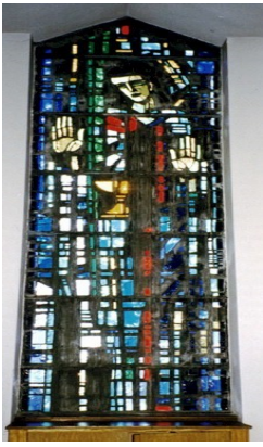
St John the Evangelist Stevenston