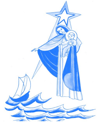
Our Lady Star of the Sea Saltcoats