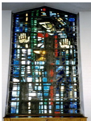
St John the Evangelist Stevenston