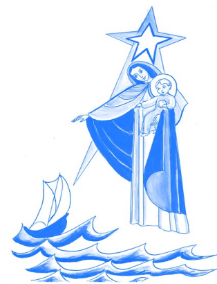
Our Lady Star of the Sea Saltcoats