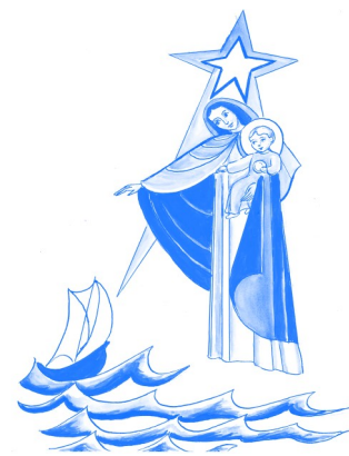
Our Lady Star of the Sea Saltcoats