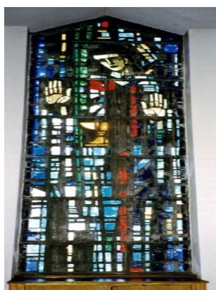
St John the Evangelist Stevenston