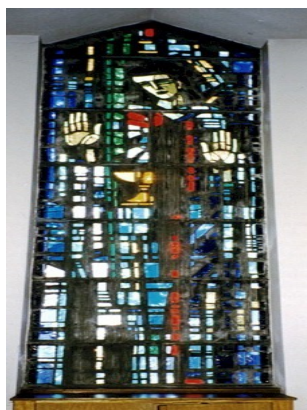
St John the Evangelist Stevenston