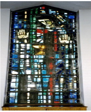
St John the Evangelist Stevenson