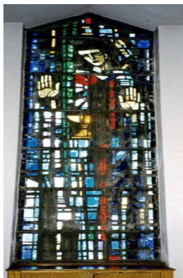
St John the Evangelist Stevenson