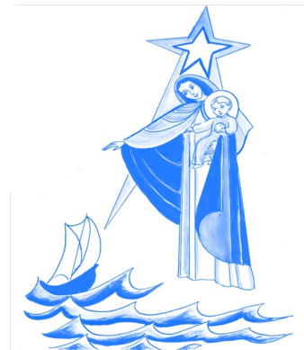
Our Lady Star of the Sea Saltcoats