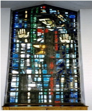
St John the Evangelist Stevenson