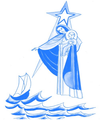
Our Lady Star of the Sea Saltcoats