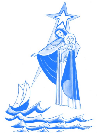
Our Lady Star of the Sea Saltcoats