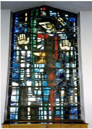
St John the Evangelist Stevenson