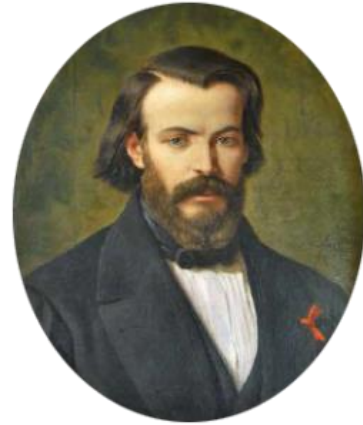
Frederick Ozanam - ssvglobal.org

The St. Mary's conference of the SSVF currently have their meeting on a fortnightly basis. The conference seeks to provide spiritual support and practical assistance to those in need by listening to them and visiting them in their homes.