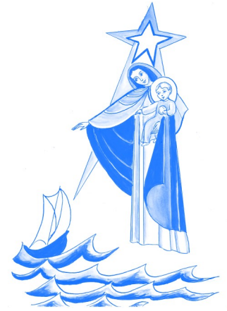
Our Lady Star of the Sea Saltcoats