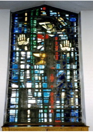
St John the Evangelist Stevenston