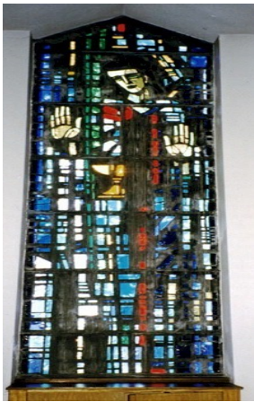
St John the Evangelist Stevenson