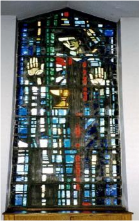
St John the Evangelist St4evnston