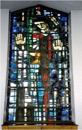
St John the Evangelist St4evnston