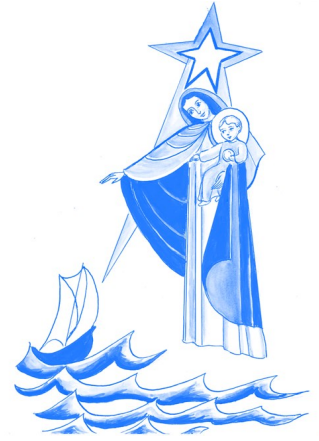
Our Lady Star of the Sea Saltcoats