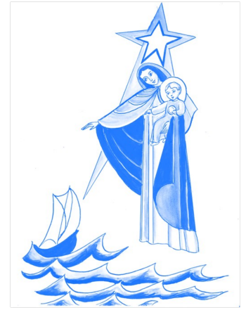
Our Lady Star of the Sea Saltcoats