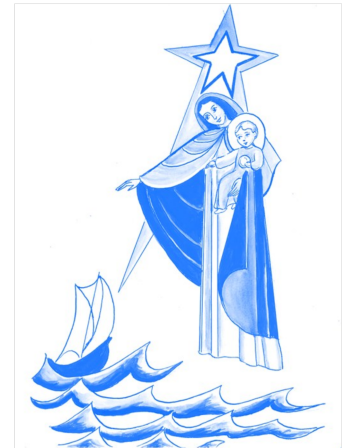
Our Lady Star of the Sea Saltcoats