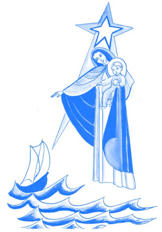
Our Lady Star of the Sea Saltcoats