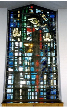
St John the Evangelist Stevenston