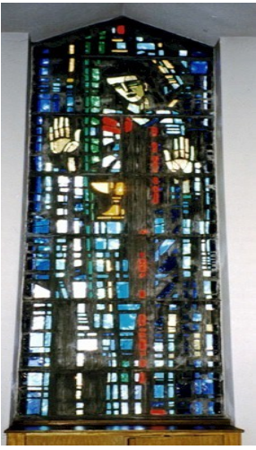
St John the Evangelist Stevenston