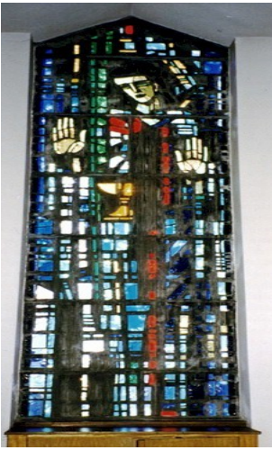
St John the Evangelist Stevenston