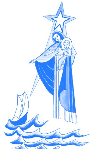
Our Lady Star of the Sea Saltcoats