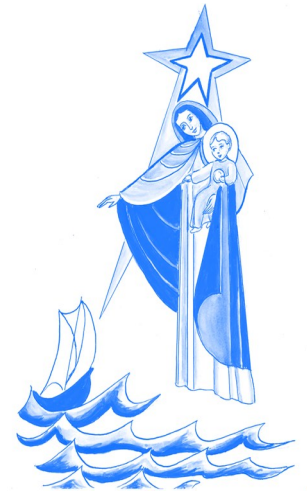
Our Lady Star of the Sea Saltcoats